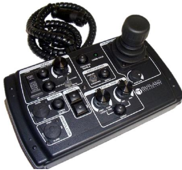
HAND CONTROLLER, HC-2000